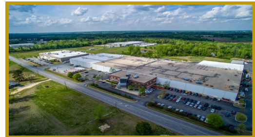
Exit 168 at Interstate 95