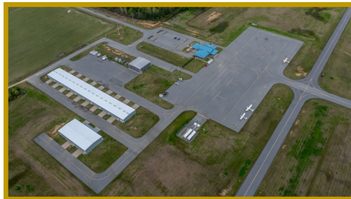
Halifax Northampton Regional Airport (IXA)